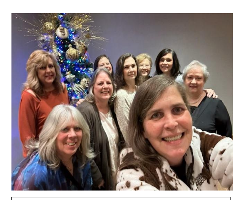
BCALP Members & Guests attending the Christmas After Party at Wind Creek Casino, Atmore – January 4, 2025

Please make plans to attend the 2025 Annual Meeting hosted by BCALP on April 25 and 26 at the Hilton Garden Inn – Orange Beach.