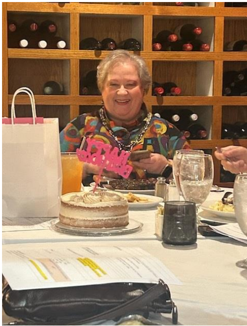
Surprise, Surprise! Turning 67 was lots of fun, thanks to BCALP!