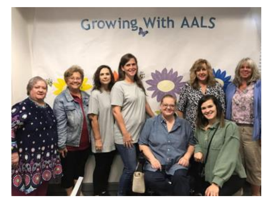
BCALP Members attending AALS Fall Board Meeting September 2024 – Hoover, AL

conference in Alabama is a major feather in AALS' cap. Bravo, AALS! And on that note, this concludes my report. I look forward to seeing everyone in Saraland in January for the Winter board meeting. Until then, Merry Christmas and have a wonderful, safe and blessed New Year.