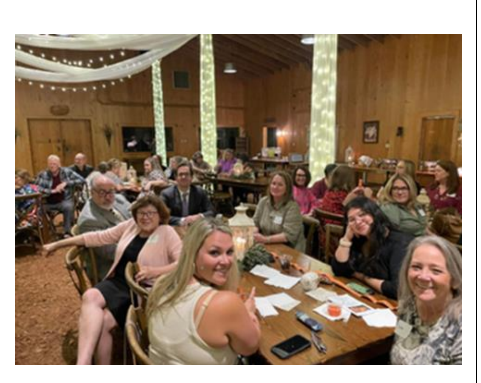
Bosses Night 2024 Highlights – What a great crowd that came out!